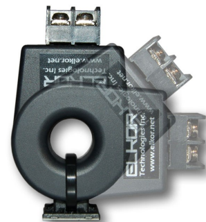
Mounting hardware for flexible surface mounting